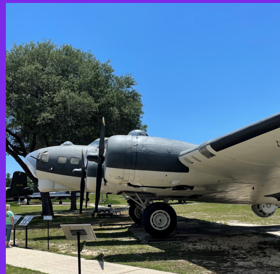
Plane my grandfather flew in WWII