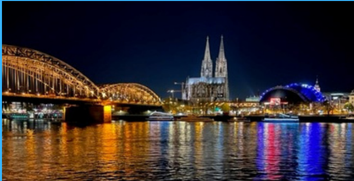
Cathedral in Cologne

Puerto Vallarta was a condo and beach type get away with friends from Flower Mound. The weather there is perfect in February. We had relaxing days on the beach and in the pool then each night dinner out at a select restaurant. This was the perfect winter get away and we can't wait to go back.